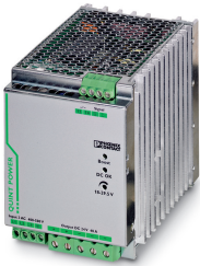
Primary-switched QUINT POWER power supply for DIN rail mounting with SFB (Selective Fuse Breaking) Technology, input: 3-phase, output: 24 V DC/40 A

Please be informed that the data shown in this PDF Document is generated from our Online Catalog. Please find the complete data in the user's documentation. Our General Terms of Use for Downloads are valid ( http://phoenixcontact.com/download )